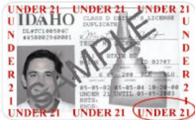
Fig 4. Idaho issued 2001 Under 21

Licenses issued before 2001, should have "Under 21" stamped on the front (Fig 5). When you receive one of these cards, remember to look at the lower right hand corner. The text in the circled in Fig. 5 tells you the date the cardholder turns 18 or 21.