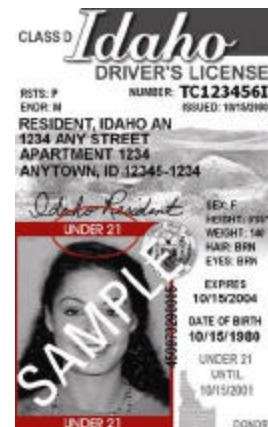
Fig. 2. Vertical format card Under 21