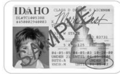
Fig 5. Idaho issued before 2001

Licenses issued before 2001, should have "Under 21" stamped on the front (Fig 5). When you receive one of these cards, remember to look at the lower right hand corner. The text in the circled in Fig. 5 tells you the date the cardholder turns 18 or 21.