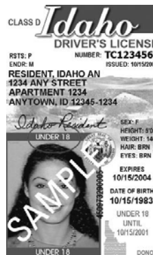
Fig. 1. Vertical format card Under 18