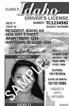
Fig. 2. Vertical format card Under 21